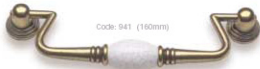
Code: 941 (160mm)