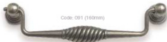
Code: 091 (160mm)