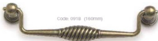
Code: 091B (160mm)